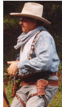
Single Action Jackson drawing for that first shot.

Practice this over and over until it becomes comfortable and natural.