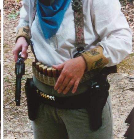
Prairie Dawn Demonstrates the strong side draw and transition