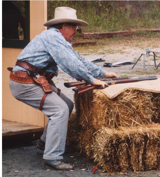
Single Action Jackson transitions from shotgun to rifle.

Lastly, don't forget about proper grip, stance, and sighting, also – practice, practice, and practice!